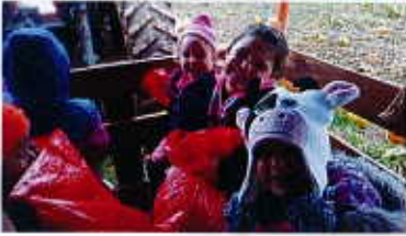
On October 12 th , Kindergarten students went to Kent Farms for a fun-filled trip!