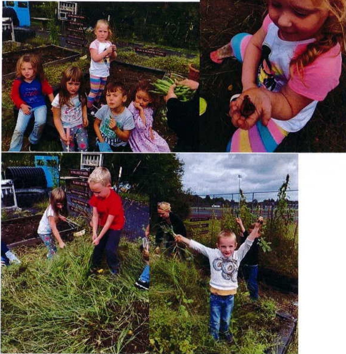
Kindergarteners were weeding and collecting tomatoes from the school garden. They are being used to make salsa for the After School Program.