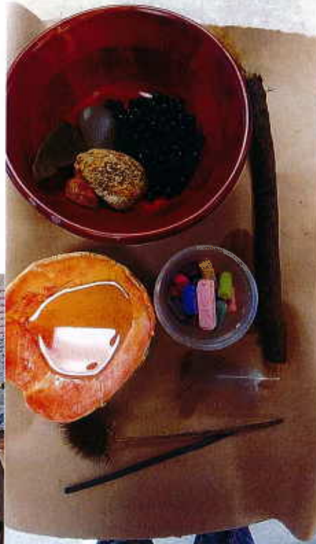
Ms. Buchholz's 6 th graders used authentic tools and colors to create their own version of cave drawings.